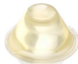
Stand-off II (Long)