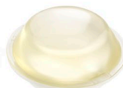
Stand-off I (Short)